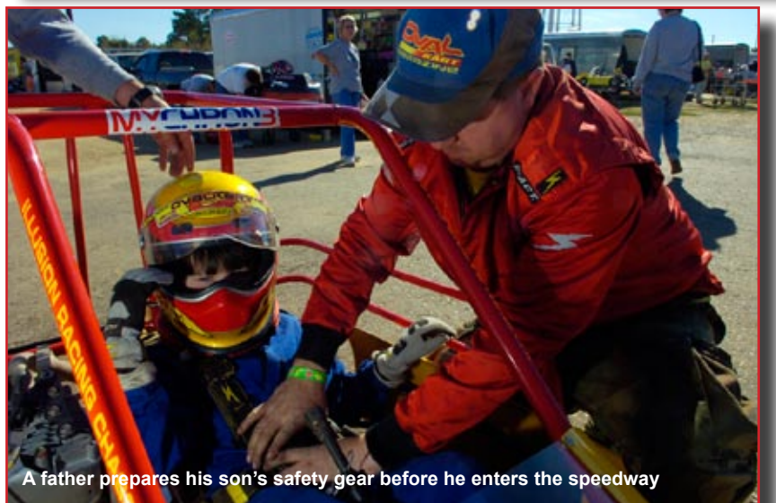
A father prepares his son's safety gear before he enters the speedway