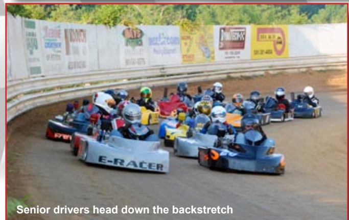
Senior drivers head down the backstretch