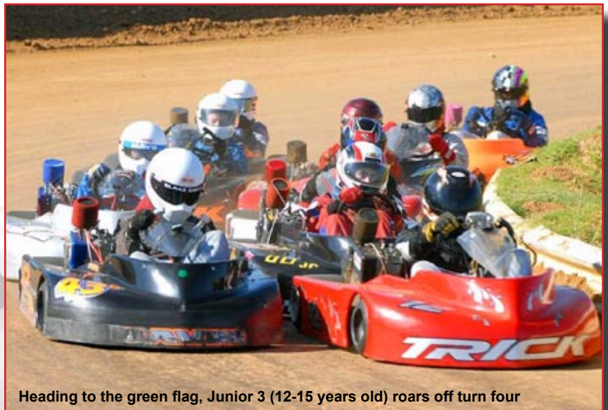
Heading to the green flag, Junior 3 (12-15 years old) roars off turn four

ARP has taken steps to reduce costs for "our" racers. Tire rules have reduced tire options and consequently reduced costs for the racers. A new type of engine that will debut in 2010 at ARP will allow many new racers to get on the track and we expect this class to really take off. A new spectator area is in planning and will expand our spectator base improving exposure to kart racing.