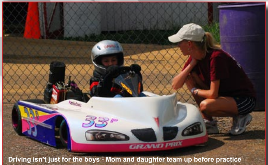
Driving isn't just for the boys - Mom and daughter team up before practice