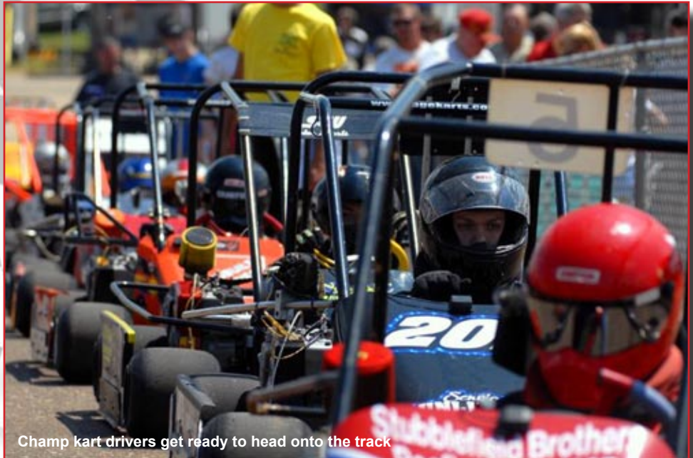
Champ kart drivers get ready to head onto the track

Atoka Raceway Park is a 1/8-mile dirt oval track located in Brighton, Tenn. at the intersection of Highway 14 and Atoka-Idaville Road (Route 206). Access to the track is located on Sadler School Road just past the fire station.