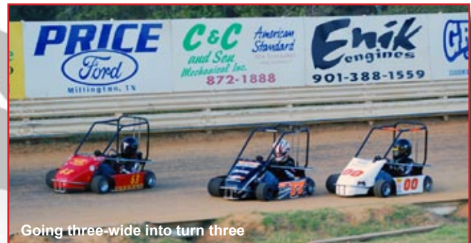
Going three-wide into turn three

Down the backstretch, there are 42 four-foot by eight-foot billboards. Each billboard is a space for your company. As different classes rotate on and off of the track, teams rotate with them several times per day. A 24-race season exposes your company's logo to spectators, teams, drivers, officials each race day. As spectators and teams enter the track they are given an event program that lists the previous event race results, season schedule, point standings, and track supporters – you. Track supporters are announced over the PA system several times per day for additional exposure. When you visit our web site, www.Atoka-Raceway-Park.com , you'll find your company logo with a hyperlink (if applicable) to your website. If the backstretch is not your thing, we have 4x8 spaces on the back of the grandstands overlooking the pit area. And five season passes will accompany you to the track each week. The price for the billboard package is $500 – and we'll take care of getting your company identity up there for you.